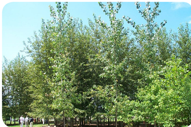
Poplar trees at a phytoremediation site.

Phytoremediation has been successfully used at many sites, including at least 10 Superfund sites across the country.